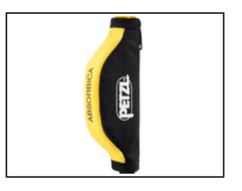
The energy absorber is very compact to avoid hindering the user's movements, or interfering with handling. A durable fabric pouch helps protect the energy absorber from abrasion and potential contaminants.